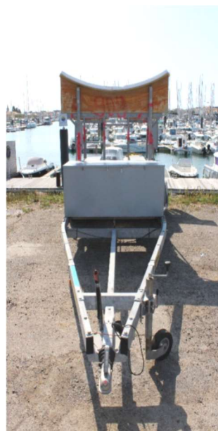
Trailer with lockable boxes