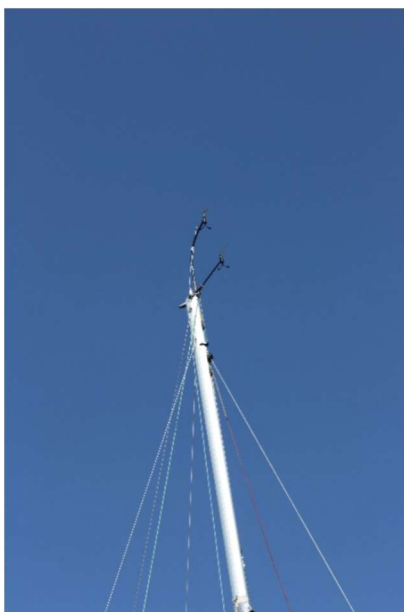
2x Wind Vanes on the masts

PRICE AROUND 80.000 € INCLUDING VAT and including the year of sharing till Mini Transat 2019. Could be very convenient for somebody who wants to train and race with her immediately. OR MAKE AN OFFER !!!