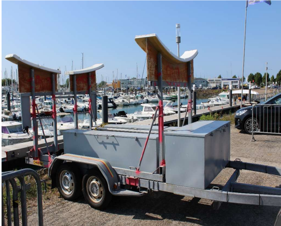
Trailer with lockable boxes and dismantable cradles